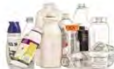
Bottles, Jars, Jugs and Tubs empty and replace cap