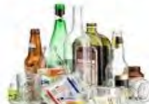
Bottles and Jars empty and rinse