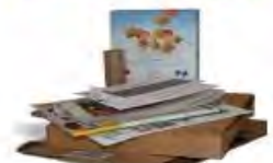
Mixed Paper, Newspaper, Magazines, Boxes empty and flatten