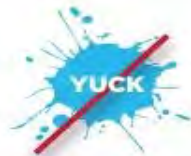
No Food or Liquid (empty all containers)